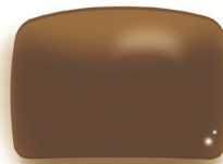
True Brown 7783261 True Brown w/AR* 7793261