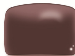
Amber Rose 7703273