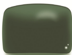
G-15 7703271 G-15 w/AR* 7763271