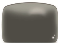
True Gray 7783274 True Gray w/AR* 7793274