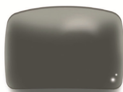
True Gray 7703274 True Gray w/AR* 7763274