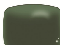
G-15 7783271 G-15 w/AR* 7793271