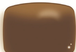
True Brown 7703261 True Brown w/AR* 7763261